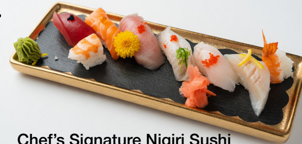
Chef's Signature Nigiri Sushi 7 Pieces.....23