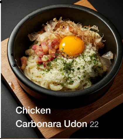
Chicken Carbonara Udon 22

Golden Soft Shell Crab Curry Omurice.....25