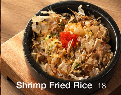
Shrimp Fried Rice 18