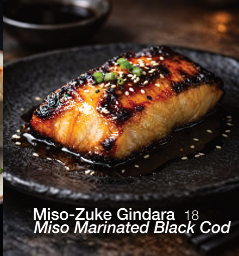
Miso-Zuke Gindara 18 Miso Marinated Black Cod