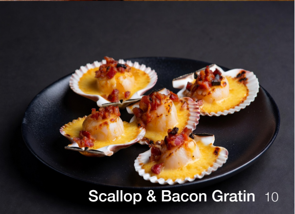
Scallop & Bacon Gratin 10