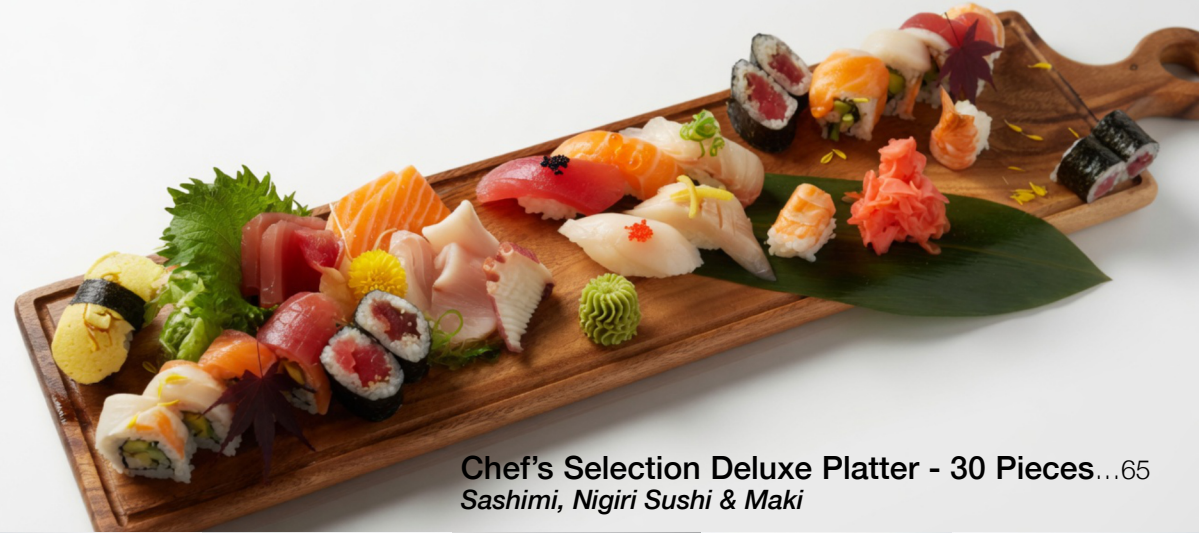
Chef's Selection Deluxe Platter - 30 Pieces...65 Sashimi, Nigiri Sushi & Maki