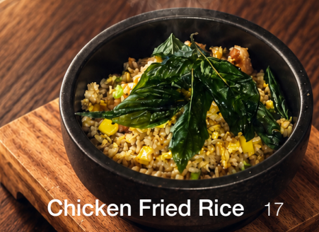
Chicken Fried Rice 17