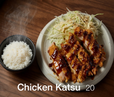
Chicken Katsu 20

(Combo up: Add $3 for Miso Soup & Salad)