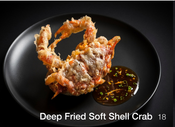
Deep Fried Soft Shell Crab 18

crispy, juicy bite-sized chicken marinated in soy, ginger, and garlic